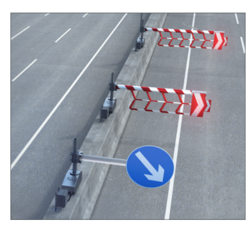
Tapered gates and gate with a directional arrow used to perform a lane closure