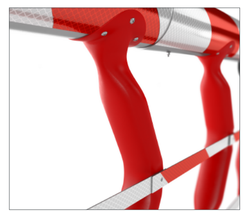
MASH crash test gate arm assembly