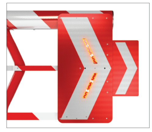
Gate chevron with flashing LED lighting