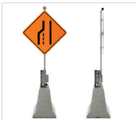
SwiftSign front view - sign deployed and retracted