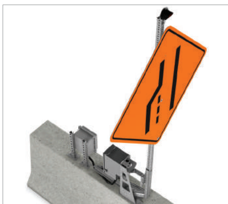
SwiftSign top view