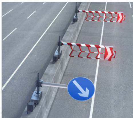
Tapered gates and gate with a directional arrow used to perform a lane closure