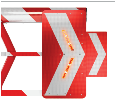
Gate chevron with flashing LED lighting