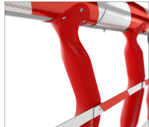
MASH crash tested gate arm assembly