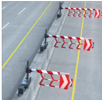
Tapered gates used to perform an automated lane closure